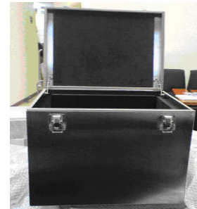
Shield Box with millimeter wave absorber