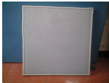
With Cover & Frame for outdoor use